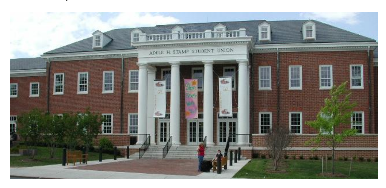
Adele H. Stamp Student Union:

The main entrance to the University of Maryland campus is on Rt. 1. After you enter, drive up to the circle with the big "M" and keep straight onto Campus Drive. After the second stop sign, the Adele H. Stamp Student Union will be on your right. The most convenient parking is in Lot HH, which will be on your left. If Lot HH is full, Lot Z and Lot 1 are the nearest parking lots. The directions to the building and parking are illustrated on the campus map below.